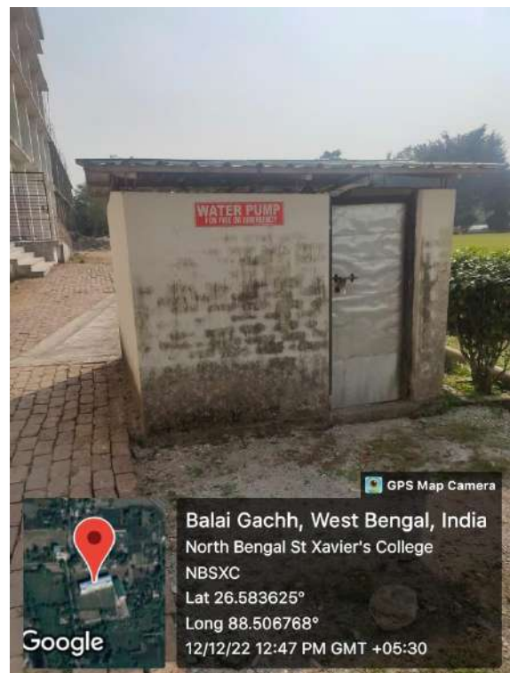
Rain Water Harvesting Tanks (Rajganj Campus)